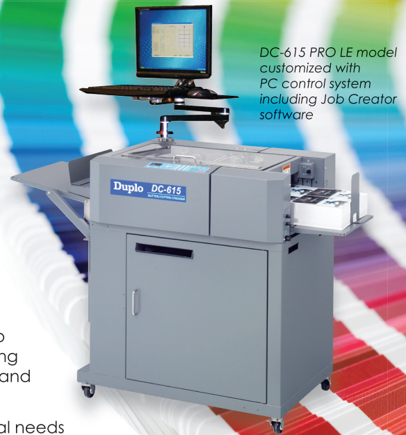
DC-615 PRO LE model customized with PC control system including Job Creator software

The easy-to-use DC-615 features an LCD control panel that guides the user through the setup of the slit, cut, and crease positions. With 80 memory settings, commonly used jobs can be conveniently stored. In addition, the automatic vacuum feeding system accurately feeds documents making the DC-615 a highly productive slitting, cutting, and creasing finishing solution.