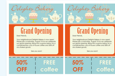
2-up Flyers on 12" x 18" with T-shape Perforated Cards