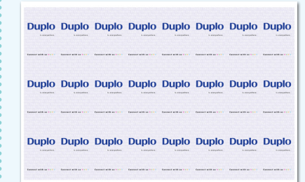
24-up Full-Bleed Business Cards on 12" x 18"