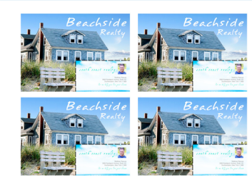
4-up Postcards on 12" x 18" with L-Shape Perforated Business Cards